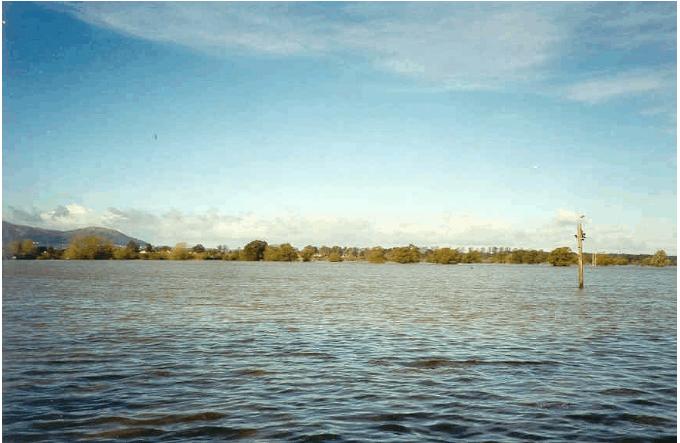
FISH MEADOW - JULY 2007.